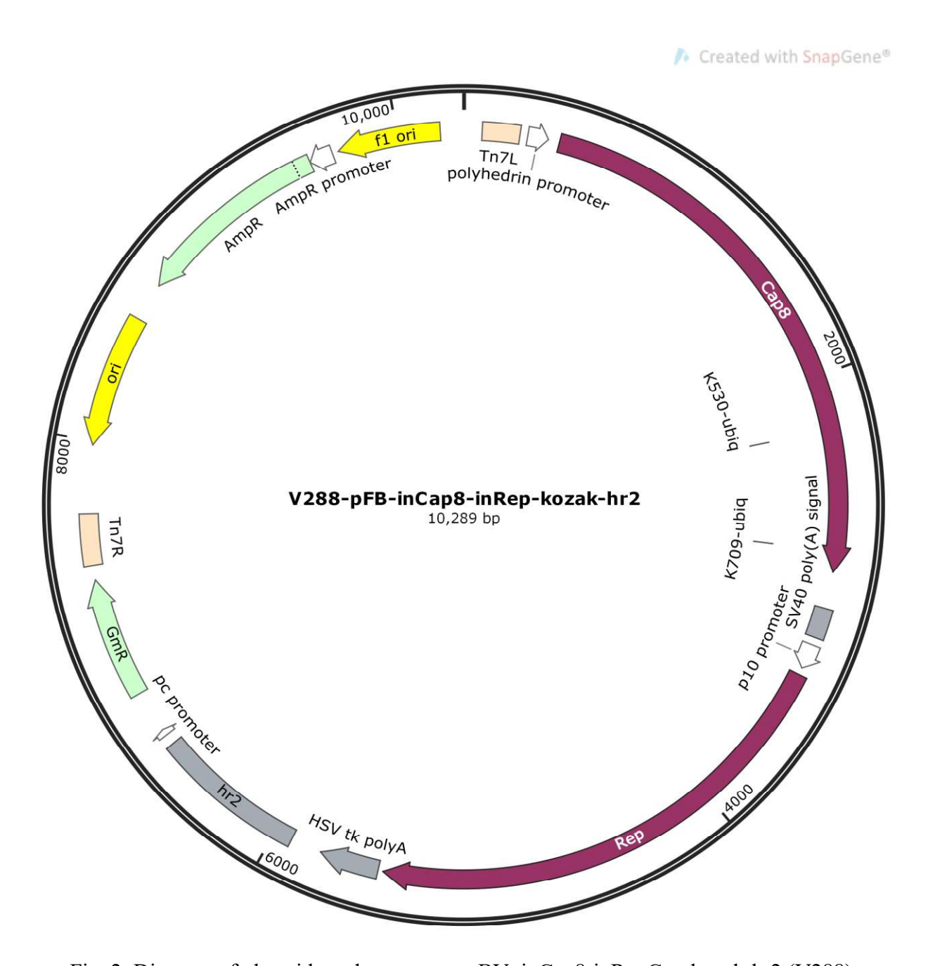
Fig. 2. Diagram of plasmid used to generate rBV- inCap8-inRepCap-kozak-hr2 (V288).

Approved by: nicky zhou <u>Tuesday, January 25, 2022</u>