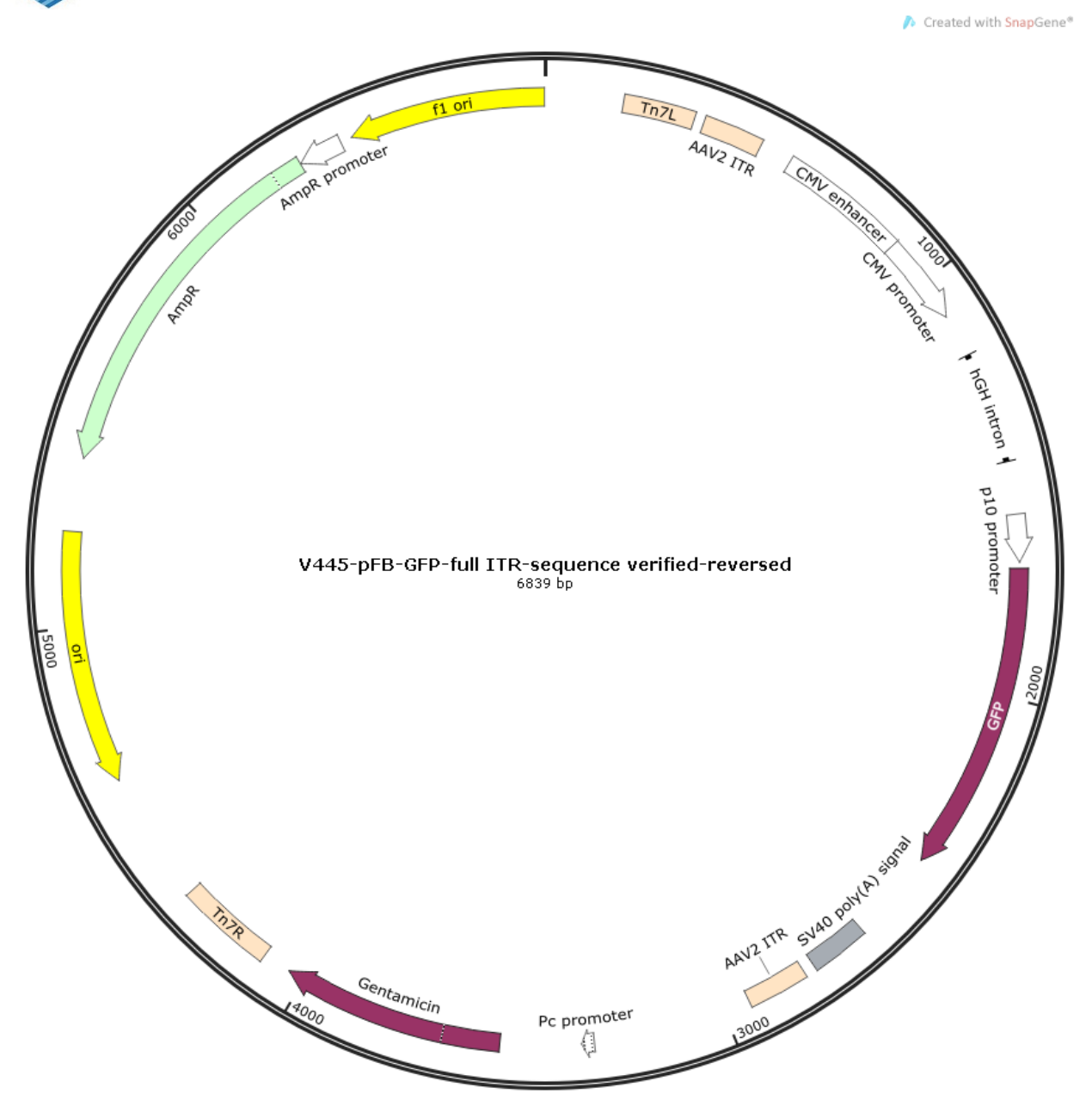
Fig. 3. Diagram of plasmid used to generate rBV-CMV-GFP (V445).

Approved by: Mieky Zhou Tuesday, March 29, 2022